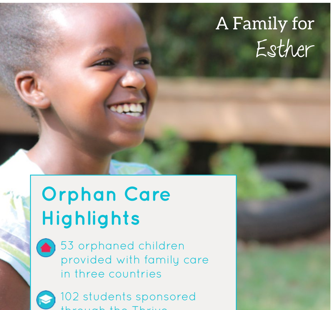
A Family for Esther

Images of children eating food out of garbage heaps and drinking nearly stagnant water from a sewage-filled stream overflow in Mathare Valley slum. It's one of the most desperate places in Kenya. Alone in front of a tiny shack, a child's eyes reflect a hint of despair. People walk by uncaringly as if the child is invisible. Even when he cries, no one comes running to comfort him. There is no one.