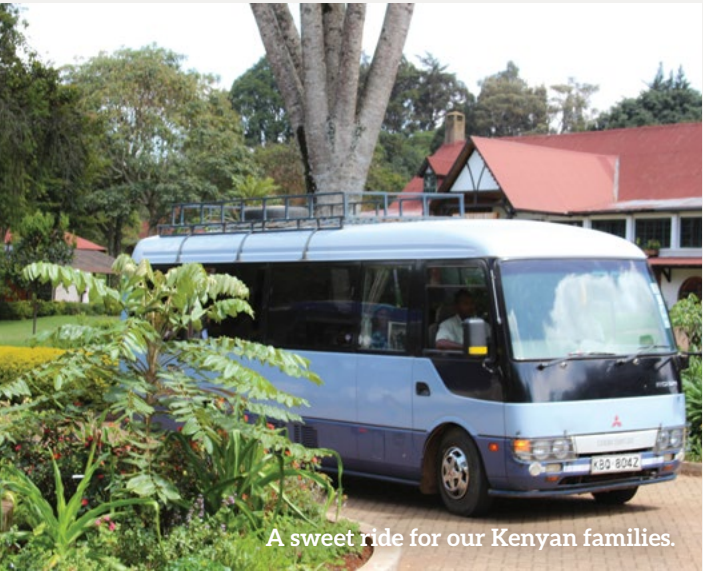
A sweet ride for our Kenyan families.